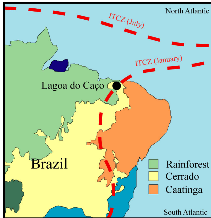
Figure 1: Location of Lagoa do Caço, present day position of the ITCZ during austral summer (January) and winter (July) and main ecosystems encountered in north-eastern Brazil.

The local present-day climate is tropical humid with pronounced seasonality. Precipitation, which annually reaches 1750mm on average, mostly occurs during the rainy season, from November to May. The mean annual temperature is 26°C. The vegetation in the watershed pertains to a large cerrado (shrub savannah) corridor inserted between the dry caatinga (savannah) ecosystem to the east and the rainforest to the west. Lagoa do Caço is therefore in a sensible position to track changes in vegetation distribution related to climate variations. Furthermore, this lake is located where the InterTropical Convergence Zone (ITCZ), that is the major control on precipitation distribution, presently enters the continent and shifts from its winter to summer position. The lake (ca. 2.5 km 2 surface area) occupies a former river valley within a dune field dating back to Pleistocene times. The maximum water depth is 10m during the wet season (austral summer) and 9m during the dry season (austral winter). The organic matter preserved in the sediments is mainly terrestrial in origin as attested both by bulk and molecular analyses (Jacob, 2003; Jacob et al., 2004a; Jacob et al. 2004b; Jacob et al., submitted).