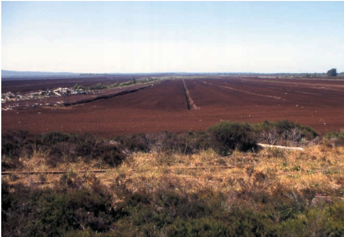
Figure 2. Example of an Irish peatland in which peat is currently being harvested on an industrial scale. This type of exploitation is the most damaging to peatlands, as all the vegetation is removed.

more effective as a greenhouse gas than CO 2 on a 20-year time scale (and 20 times greater on a 100-year time scale). It would appear therefore that active peatlands are positive contributors to global warming, and that peatland utilization actually reduces this contribution, at least in the short term (Schilstra 2001).