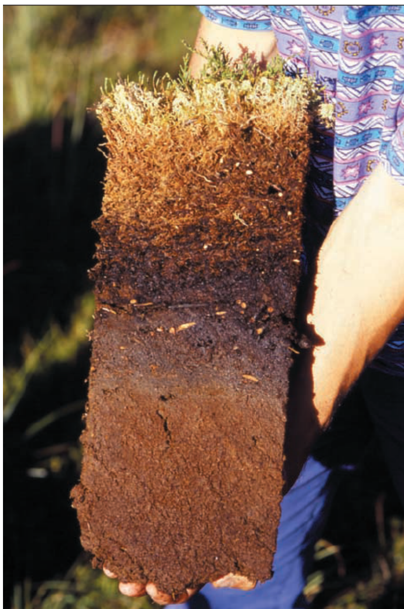
Figure 3. Peat profile taken on a mined peatland where successful regeneration has occurred through initial colonization by the moss Polytrichum strictum and later recolonization by Sphagnum fallax . The former peat surface is visible at the bottom. The dark brown layer is the former peat surface that has undergone partial decomposition under oxygenated conditions. The less decomposed, lighter brown peat with recognizable plant remains lies above, and the living mosses and vascular plants are at the top.

approximately 500 000 km 2 , approximately the area of Spain. This represents about 16% of peatlands' former extent. Today, however, losses are due almost entirely to agriculture and forestry (> 99.8%), whereas losses due to peat extraction are very minor (< 0.2%) (Joosten and Clarke 2002). Since the 1950s, for example, Finland has lost 60% of its former extensive active peatland area to forestry and many of the more fertile peatlands (fens) had been used for agriculture long before then (Heikkilä and Lindholm 2000).