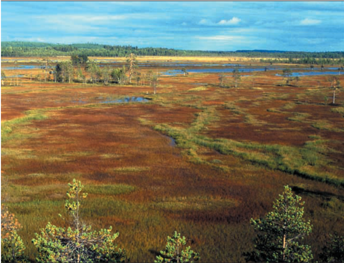
Figure 1. A pristine peatland.