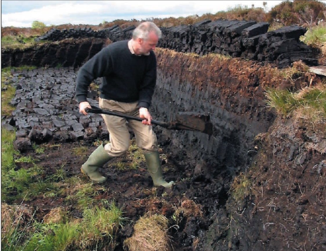
Figure 5. Traditional peat cutting in Scotland. This kind of relatively low-impact exploitation of peatlands may increase biodiversity by recreating transitional habitats.

have failed to return to cutover sites, even several decades after abandonment (Desrochers et al. 1998).