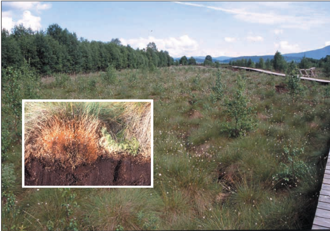
Figure 4. Sphagnum recolonization under the protection of cottongrass Eriophorum vaginatum , growing over a former bare peat surface in the Swiss Jura Mountains. Inset shows sliced tussock with Sphagnum growing between two tussocks.