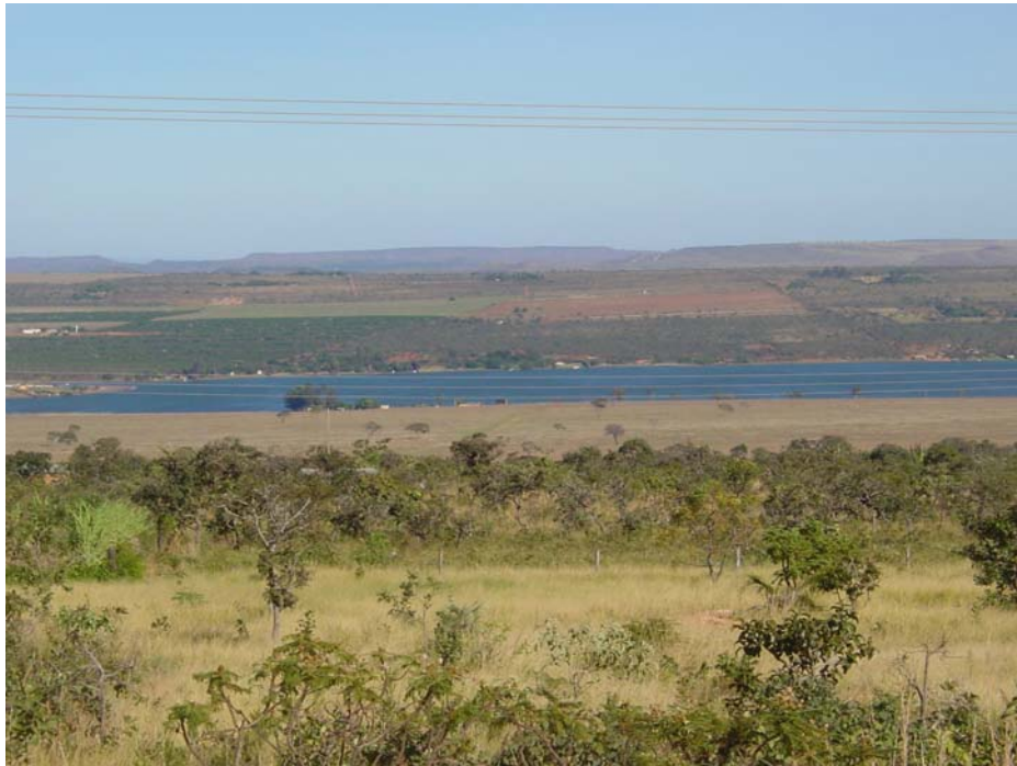
Landscape of the geomorphic surfaces of the Brazilian Central Plateau.

Latosols whose parent materials were originated from lateritic crusts and saprolites of detritic and mafic granulite rocks. The averaged K_i and K_r were respectively 1.10 and 0.86 on the Velhas Surface with Latosols whose parent materials originated from colluvial pediments from South American Surface and saprolites of pelitic rocks. The ratio kaolinite/kaolinite+gibbsite (RKGb) ranged from 0.24 to 0.78, and the averaged RKGb was 0.35 on the South American Surface and 0.70 on the Velhas Surface. The ratio hematite/hematite+goethite (RHGt) ranged from 0 to 1, and the averaged RHGt was 0.36 on the South American Surface and 0.74 on the Velhas Surface. The kaolinite content ranged from 20 to 65 \text{g.kg}^{-1} for the Latosols studied, the averaged content being 28 \text{g.kg}^{-1} for Latosols located on the South American Surface and 55 \text{g.kg}^{-1} for Latosols located on the Velhas Surface. The gibbsite content ranged from 22 to 63 \text{g.kg}^{-1} , the averaged content being 52 \text{g.kg}^{-1} for Latosols located on the South American Surface and 27 \text{g.kg}^{-1} for Latosols located on the Velhas Surface.