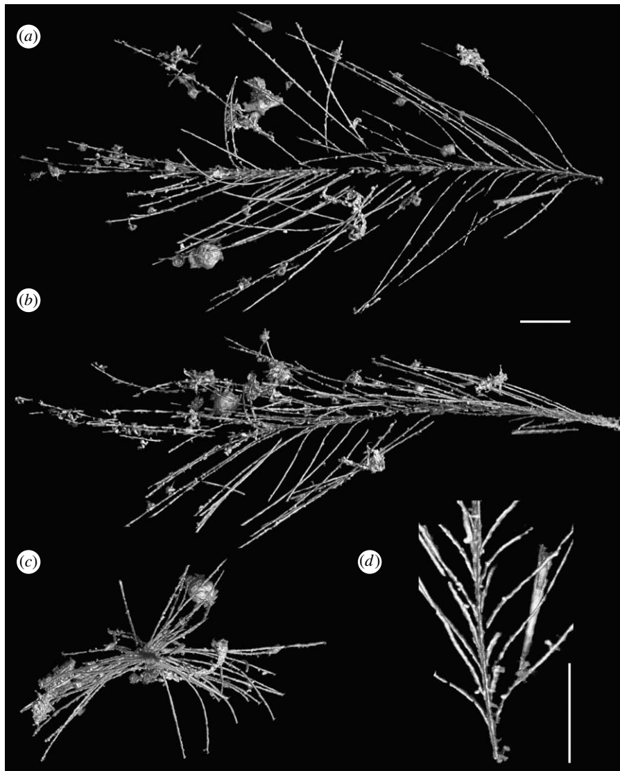
Figure 2. Three-dimensional virtual reconstruction of one fossil feather in phase contrast microtomography: (a–c) long barbs form two vanes on each side of a relatively flattened shaft; (d) the shaft is flattened and composed by the still incompletely fused bases of the barbs, a stage in feather evolution that was hitherto unknown in fossil and recent records. Scale bars, 100 \mu\text{m} .

follicle. The structure observed in these specimens from French amber therefore represents the first fossil evidence of the intermediate stage between the very distinct stages II and IIIa defined by Prum (1999) in his theory of evolutionary diversification of feathers. Stage II is characterized by non-ramified barbs attached at their base to the calamus, without barbules. Stage IIIa corresponds to the appearance of a central shaft formed by the fusion of non-ramified barbs and the appearance of the planar form. Stage IIIb exhibits barbules without differentiation between basal or distal part of the feather, unlike in stage IV (figure 3). Similarly, the new fossils take place between stages II and III defined by Xu (2006), and more precisely correspond to the early phase of stage III. The present discovery, therefore, sheds new light on the idealized nature of the developmental stages of feather evolution. Indeed, with a long rachis appearing before the barbules, it emphasizes stage IIIb as unlikely and stage IIIa as more likely evolving after stage II. We prefer not to create a new stage for this morphology, as it merely illustrates a transition between two well-established stages rather than a distinct, stable stage. According to Prum (1999), Bock (2000) and Prum & Brush (2002), such