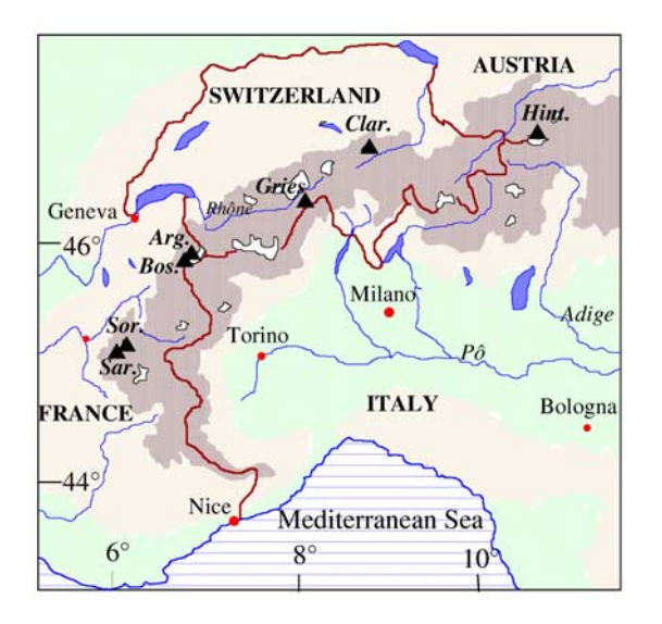
Figure 1. Map of the Alps. The glaciers of Sarennes (Sar.), Saint Sorlin (Sor.), Argentière (Arg.), Bossons (Bos.), Gries, Clariden (Clar.), and Hintereisferner (Hin.) are plotted on the map.

of this glacier, an extra 1.0 m w.e. yr^{-1} must be added to the present surface mass balance values (averaged over the last 50 years). This figure is consistent with other results found in the literature [ Schmeits and Oerlemans , 1997]. With this method, the cumulative mass balance since 1830 reads -63.6 m w.e. The uncertainties arising from the ice flow modeling and from steady state assumptions can reach a maximum value of 10 m w.e. on the cumulative mass balance between 1830 and present.