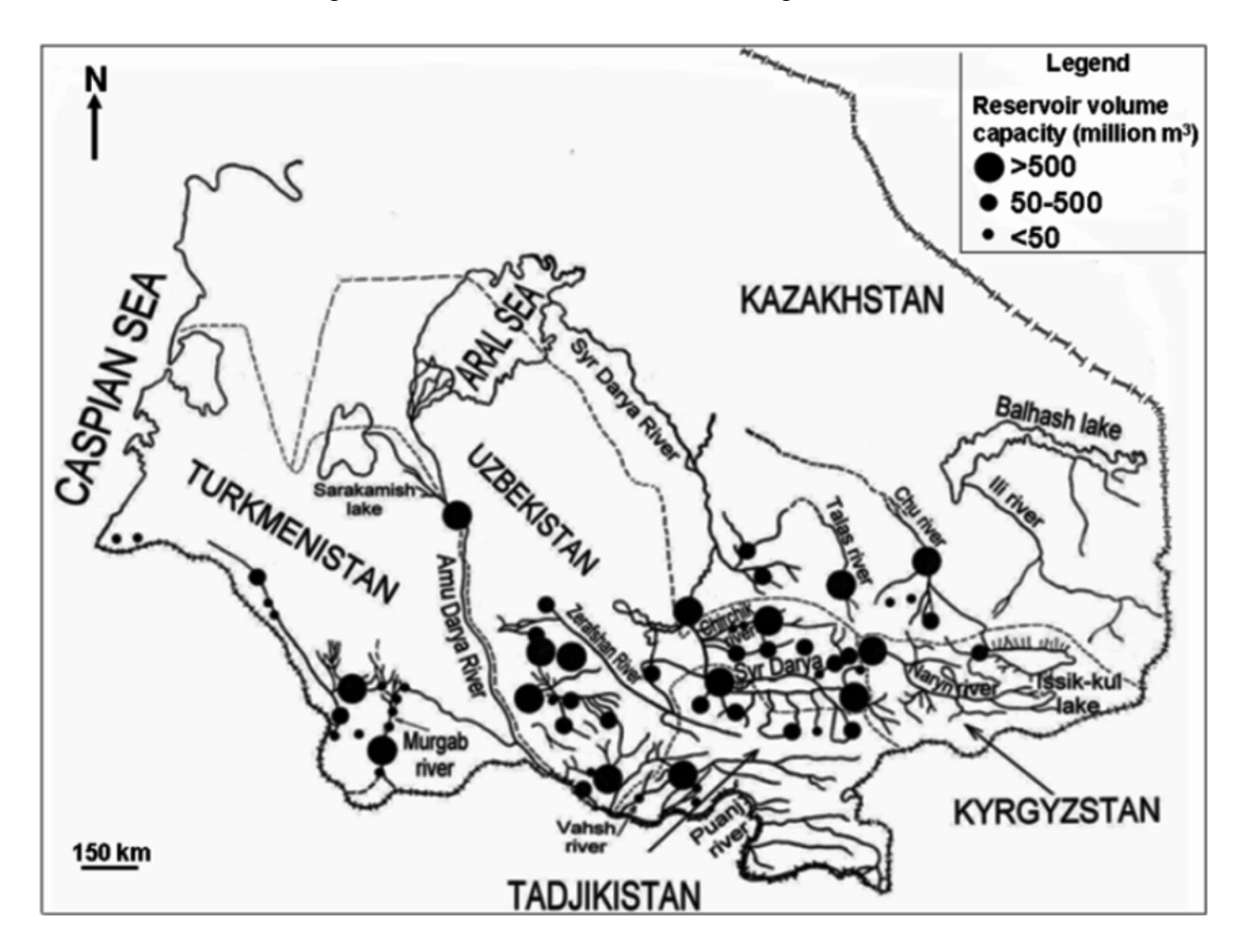
Figure 1 . Schematic location of main water reservoirs and their volume capacities in Central Asia (excluding reservoirs in central and northern region of Kazakhstan).

The era of massive water reservoir construction was documented in the late 1900s. From 1950 to 1980) more than 60 large reservoirs have been constructed in the region (Figure 2). The gross reservoir volume has increased by 50 folds from 0.17 to 49.3km<sup>3</sup> as a part of unprecedented increase of water storage capacities around the globe. Most of the dams and water reservoirs in the region have been constructed for irrigation purposes with a few for hydropower generation. As a result over a period of 90 years (1913-2003) the areas under irrigation have increased by 3 fold in Central Asia, e.g. from 4.51 million ha in 1960 to 6.92 million ha in 1980 and to 7.85 million ha in 2000 [13; 25]. The peak of dam construction is dated to the soviet period when its policy was aiming at expanding irrigated lands for the mass production of cotton.