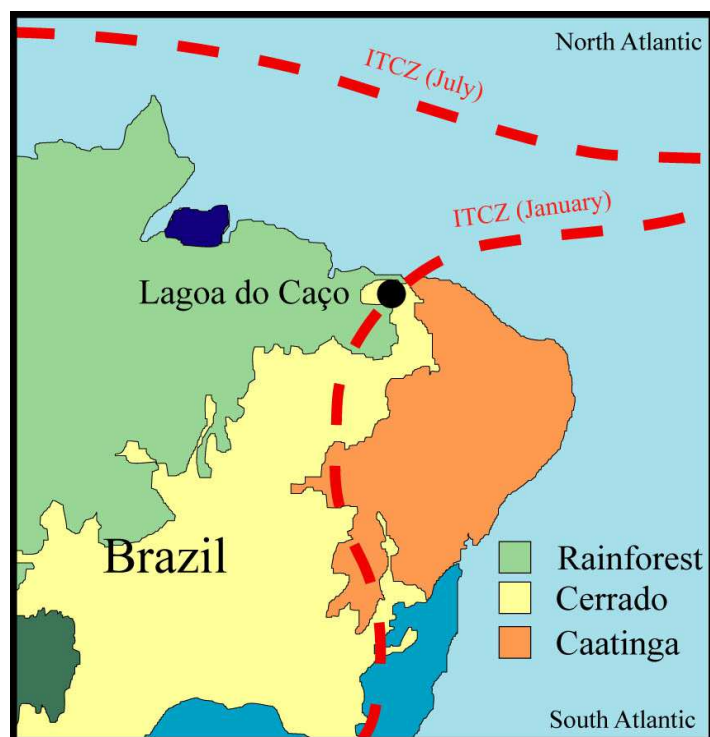
Figure 1: Location of Lagoa do Caço, present day position of the ITCZ during austral summer (January) and winter (July) and main ecosystems encountered in north-eastern Brazil.

The local present-day climate is tropical humid with pronounced seasonality. Precipitation, which annually reaches 1750mm on average, mostly occurs during the rainy season, from November to May. The mean annual temperature is 26°C. The vegetation in the watershed pertains to a large cerrado (shrub savannah) corridor inserted between the dry caatinga (savannah) ecosystem to the east and the rainforest to the west. Lagoa do Caço is therefore in a sensible position to track changes in vegetation distribution related to climate variations. Furthermore, this lake is located where the InterTropical Convergence Zone (ITCZ), that is the major control on precipitation distribution, presently enters the continent and shifts from its winter to summer position. The lake (ca. 2.5 km 2 surface area) occupies a former river valley within a dune field dating back to Pleistocene times. The maximum water depth is 10m during the wet season (austral summer) and 9m during the dry season (austral winter). The organic matter preserved in the sediments is mainly terrestrial in origin as attested both by bulk and molecular analyses (Jacob, 2003; Jacob et al., 2004a; Jacob et al. 2004b; Jacob et al., submitted).