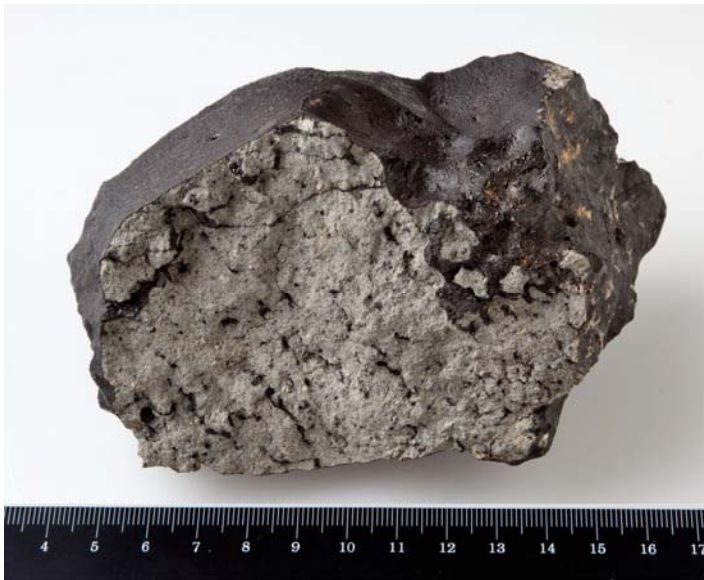
Fig. 1. The Natural History Museum (London) stone. This 1.1 kg stone (BM.2012,M1) exhibits a black fusion crust with glossy olivines. The olivine macrocrysts (pale green) and the numerous black glass pockets and veins, are characteristics of this shergottite. The scale is in cm.

Exposure ages (CRE ages) computed for ^3\text{He}_c , ^{21}\text{Ne}_c , and ^{38}\text{Ar}_c are 1.2 \pm 0.4 , 0.6 \pm 0.2 and 0.9 \pm 0.4 Ma respectively, resulting in an average CRE age of 0.7 \pm 0.3 Ma for Tissint. This age is in the range of CRE ages of other shergottites, notably that of EETA79001 ( 0.73 \pm 0.15 Ma (2)), suggesting that Tissint and other shergottites were ejected during a single event. Nitrogen isotopes were analyzed together with the noble gases. The glass aliquot displayed a well-defined excess of ^{15}\text{N} , which persisted after correction for contribution of cosmogenic ^{15}\text{N}_c (assuming a production rate of 6.7 \pm 2.6 \times 10^{-13} mol ^{15}\text{N}/\text{gMa} ) (12). This excess ^{15}\text{N} is best explained by trapping of a Martian atmospheric component (2). Using a \delta^{15}\text{N} versus ^{40}\text{Ar}/\text{N} correlation and taking a Martian atmospheric value from the Viking measurements, of 0.33 \pm 0.03 (13), we obtain a \delta^{15}\text{N} value of 634 \pm 60 ‰ (1 \sigma ), which agrees well with the Viking measurement of 620 \pm 160 ‰ (14) (Fig. 3).