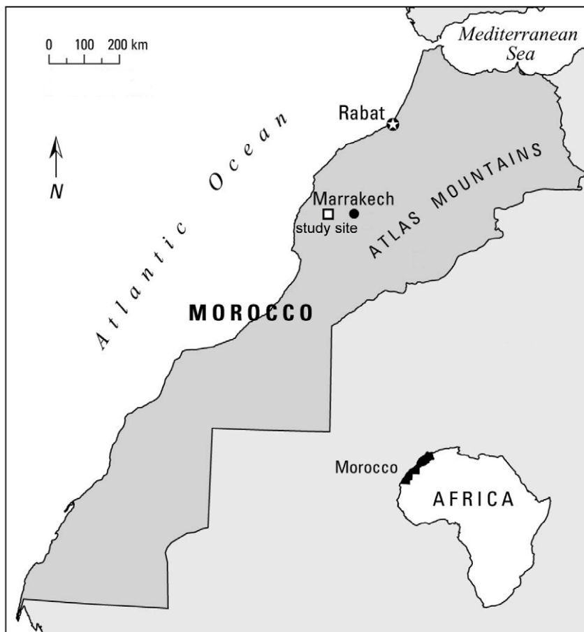
Figure 1. Map showing the geographic location of the M'Sabih Talaa Reserve, West central Morocco. The location of the study site is indicated by the square.