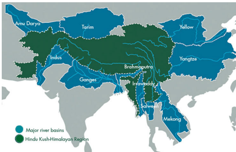
Figure 1. The Hindu Kush Himalayas region and the 10 river basins emanating from it.

common. While understanding the science of river hydrology and glaciology is very important in the context of the HKH given the primacy of rivers, snow and glaciers, it is equally important to understand the local-level water issues facing the mountain communities. This is because decisions that affect access to water for the people of the HKH are rarely made at the river-basin scale but are forged at local levels. A balanced understanding across scales, from the river-basin scale to the micro-watershed scale, is needed if we are to arrive at a comprehensive understanding of the challenges and opportunities offered by the Himalayan waters. This cross-scale understanding must also be set in the context of the vast socio-economic and demographic changes taking place in the mountains, which face numerous drivers of change, including globalization, urbanization, out-migration and feminization of agriculture, in addition to climate change.