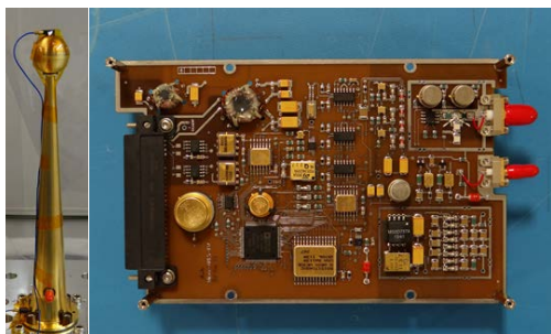
Figure 1 : Micro-ARES antenna and board

The Martian atmospheric electric fields are suspected to be at the very basis of various phenomenon such as dust lifting [1][2][3], formation of oxidizing agents [2][4] or Schumann resonances [5]. Although the data collection by DREAMS will be restricted to a few days of operations, these first results will be of importance to understand the Martian dust cycle, the electrical environment and possibly relevant to atmospheric chemistry. The instrument, a compact version of the ARES instrument for the ExoMars Humboldt payload [6], is composed of an electronic board, with an amplification line and a real-time data processing DSP, which handles the electric signal measured between the spherical electrode (located at the top of a 27-cm high antenna) that adjusts itself to the local atmospheric potential, and the lander structure, connected to the ground.