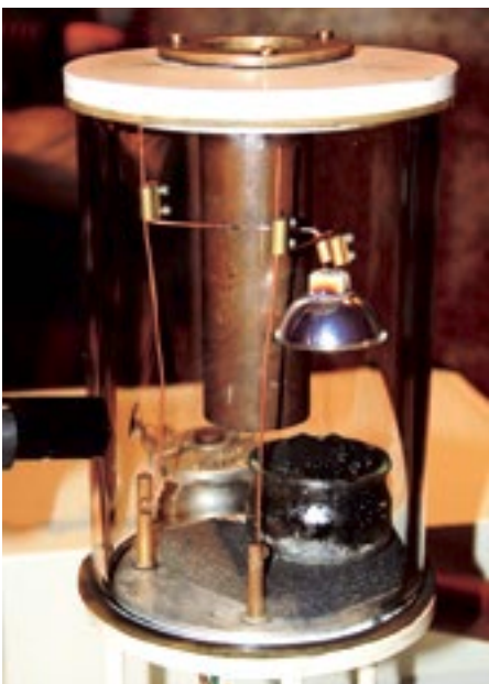
Figure 4. Experimental setup. The glass container with the sample is in a vacuum chamber; the liquid nitrogen trap is the copper cylinder in the middle of the chamber which is open at its top; and the halogen lamp is above the sample.

When the lamp is turned off (assuming the environmental lightening is not too strong), nothing will happen, mimicking the conditions far away from the Sun. When the lamp is switched on, small jets of dust are soon ejected from the surface of the sample (Figure 5). The black carbon on the surface absorbs the light and the surface heats up, just as the black surface of the comet does. The gas coming from the sublimating ice accumulates in the porous parts of the sample, and is suddenly ejected, carrying the dust. Jets appear at different locations over the surface and may last from several seconds to more than one minute.