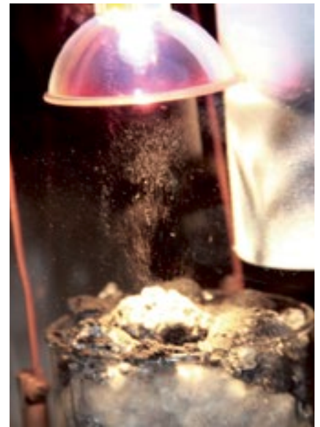
Figure 5. Jets coming from the porous comet analogue sample once the halogen lamp is switched on. The nitrogen trap is visible on the upper left.

This demonstration has been given at the Palais de la Découverte without any age restriction, although it is not recommended for too young an audience. The audience, whatever its age, was impressed by the sudden appearance of jet-like structures when the light is switched on, and their disappearance when the light is switched off.