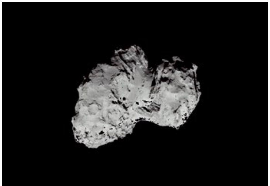
Figure 1. The nucleus of comet 67P/C-G Churyumov–Gerasimenko, seen by the NavCam camera on board the Rosetta spacecraft on 19 August 2014.

To celebrate the Rosetta rendezvous and prepare for the Philae landing, public initiatives were conducted by the media and science museums. The Palais de la Découverte in Paris worked with ESA and