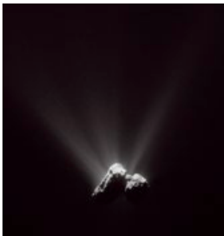
Figure 6. Jet-like features rising from the nucleus of 67P/C-G on 16 August 2015, seen by the NavCam camera from a distance of 331 kilometres.