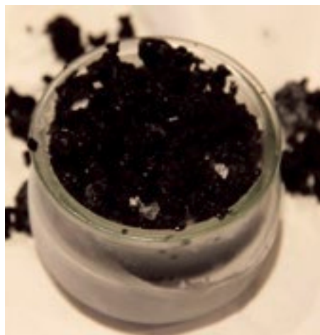
Figure 3. The cometary analogue sample in a glass container.

the comet nucleus and can extend for tens of thousands of kilometres.