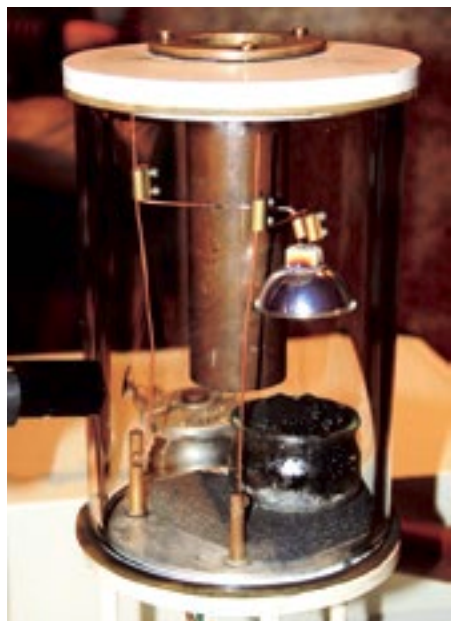
Figure 4. Experimental setup. The glass container with the sample is in a vacuum chamber; the liquid nitrogen trap is the copper cylinder in the middle of the chamber which is open at its top; and the halogen lamp is above the sample.

When the lamp is turned off (assuming the environmental lightening is not too strong), nothing will happen, mimicking the conditions far away from the Sun. When the lamp is switched on, small jets of dust are soon ejected from the surface of the sample (Figure 5). The black carbon on the surface absorbs the light and the surface heats up, just as the black surface of the comet does. The gas coming from the sublimating ice accumulates in the porous parts of the sample, and is suddenly ejected, carrying the dust. Jets appear at different locations over the surface and may last from several seconds to more than one minute.