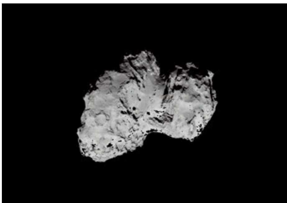
Figure 1. The nucleus of comet 67P/C-G Churyumov–Gerasimenko, seen by the NavCam camera on board the Rosetta spacecraft on 19 August 2014.

To celebrate the Rosetta rendezvous and prepare for the Philae landing, public initiatives were conducted by the media and science museums. The Palais de la Découverte in Paris worked with ESA and