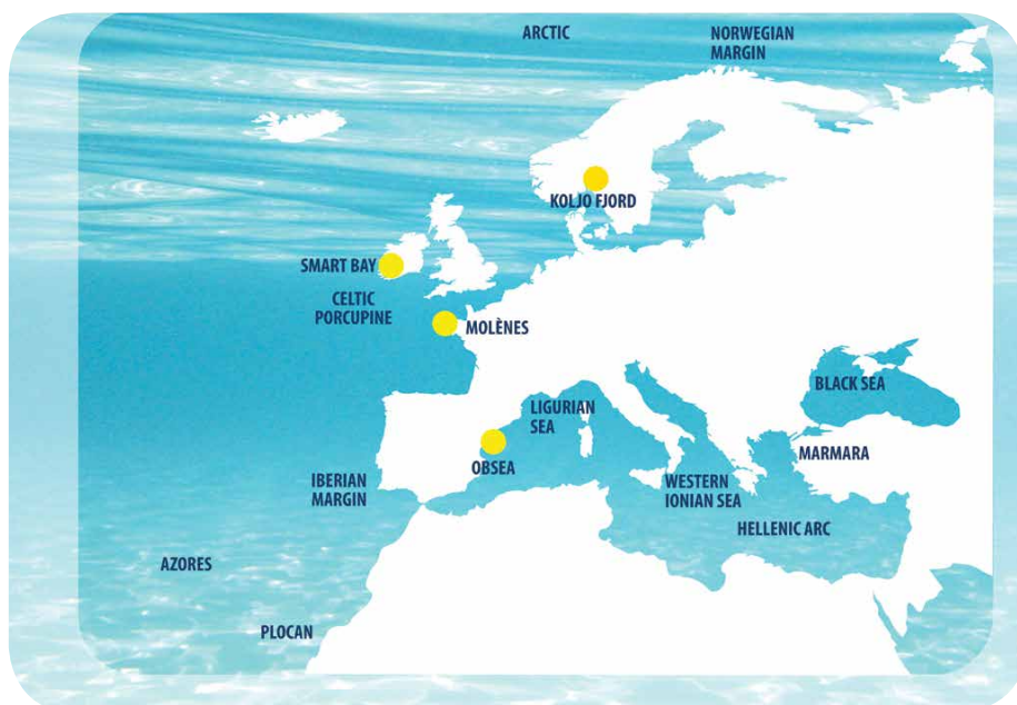
Figure 1. Map of current EMSO nodes. Yellow dots indicate testbeds.

Turkey, Germany, and the Netherlands. Participation is open to all (both individual scientists and institutions), and will be coordinated through an association called ESONET-Vi (European Seafloor Observatory NETwork—The Vision), following the extensive scientific community planning