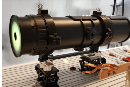
Fig. 3. – AntarctiCor in the INAF Optical Payload Systems facility, Turin, for tests and calibrations.

The objective lens makes a real image of the Sun-disk on the internal occulter. This is a reflecting prism rejecting the sunlight into a light trap. A microscope allows the view of the Sun-disk image on the internal occulter to check their relative centering (see Figure 2). The stray-light analysis, performed by following the same approach in Ref. [9], indicates an expected stray-light level < 10^{-9} of the Sun-disk brightness.