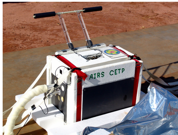
Figure 2. The LATMOS gondolas for TLE and electric fields measurements

Another important point to examine carefully with CNES is the electric power needed for the instrument and the data transmission capacity. Even if the use of satellite links is possible, it is possible that the telemetry capacity may affect the payload. Trade offs could be necessary.