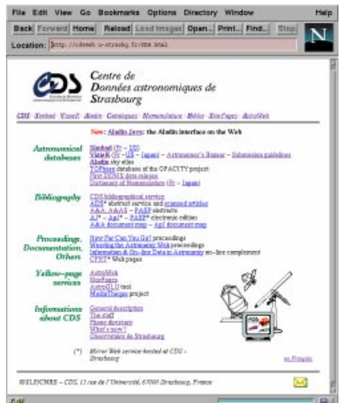
Fig. 2. CDS home page on the World-Wide Web

a few months to a few years; R&T activities, on similar times scales; and operational constraints on a day-to-day basis. Hence the importance of careful strategy definition and activity scheduling.