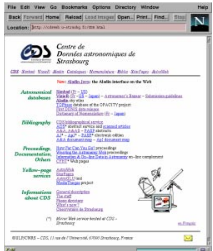
Fig. 2. CDS home page on the World-Wide Web

a few months to a few years; R&T activities, on similar times scales; and operational constraints on a day-to-day basis. Hence the importance of careful strategy definition and activity scheduling.