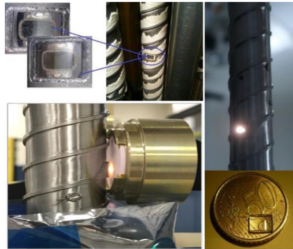
Fig.1: Ma_MISS Sapphire Window during drilling tests; illuminated by the lamp; with the rover observing spectral sample and in comparison with a coin.

By combining a number of column and ring observations, Ma_MISS allows the reconstruction of a fairly complete image of the borehole wall.