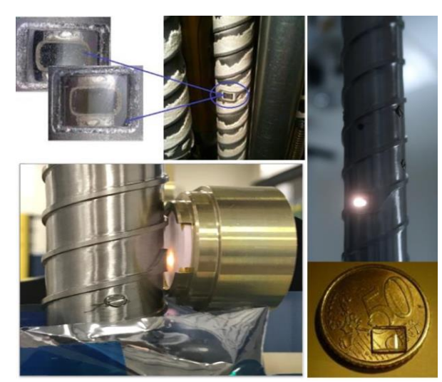
Fig.1: Ma_MISS Shapphire Window during drilling tests; illuminated by the lamp; with the rover observing spectral sample and in comparison with a coin.

By combining a number of column and ring observations, Ma_MISS allows the reconstruction of a fairly complete image of the borehole wall.