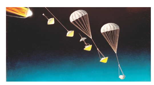
Figure 1: Entry, Descent into the Ice Giant atmosphere

The atmosphere of Uranus and Neptune, the Ice Giants of our Solar System, were probed by the Voyager 2 during its flyby in 1986 and 1989 respectively. The atmospheric temperature profiles were primarly retrieved from the Voyager radio occultations [3], [4]; while both ground based and Voyager thermal infrared, solar and stellar occultation observations further constrained the thermal structure (e.g. [5]).