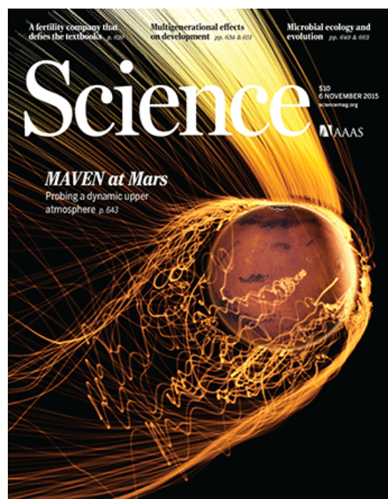
Figure 3. The Mars Atmosphere and Volatile Evolution (MAVEN) mission has provided dramatic evidence for atmospheric erosion. Unshielded from the solar wind due to the lack of a global magnetic field, Mars' atmosphere is eroded via an interaction with the solar wind. Assessing extrasolar planetary magnetic fields may be essential in understanding their potential habitability. (From Jakosky et al. 2015, 2018; reprinted with permission from AAAS.)

A comparison of Earth to Mars and Venus is often used to support the argument that magnetic fields can prevent loss of water from atmospheres (e.g., Lundin et al. 2007). Earth, with its strong dipole field, has an atmosphere that allows liquid surface water and sustains life. Mars, which lacks a strong global field, has an atmospheric pressure less than 1% that of Earth, but surface magnetization and morphology such as lake beds suggest that a strong global magnetic field and surface liquid water existed about 4 Gyr ago. The Venusian atmosphere, unprotected by a global magnetic field, has a surface pressure 90× Earth, but with little water content. Early water on Venus could have been disassociated, with the hydrogen lost to space and the oxygen absorbed into crustal rocks (e.g., Driscoll & Bercovici 2013). Indeed, Earth would have a substantial CO 2 -dominated atmosphere were it not for the effect of Earth's oceans in removing CO 2 from the atmosphere.