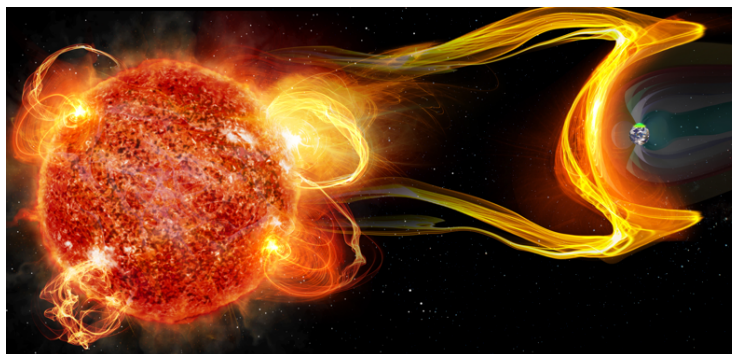
Figure 1. Artist's impression of an extrasolar planet's magnetosphere shielding the planet from a violent eruption of its low-mass host star. The Earth, Mercury, Ganymede, and the giant planets in the solar system generate magnetospheres from internal currents, knowledge of which constrains their interior structures. Magnetosphere-stellar wind interactions produce radio emissions that may be detectable over interstellar distances. ( Figure not to scale; credit: Keck Institute for Space Studies )

Internal dynamos arise from differential rotation, convection, compositional dynamics, or a combination of these processes. Knowledge of extrasolar planetary magnetic fields places constraints on internal compositions and dynamics, which will be difficult to determine by other means, as well as informs the extent to which the surfaces and atmospheres of terrestrial planets are shielded and potentially habitable.