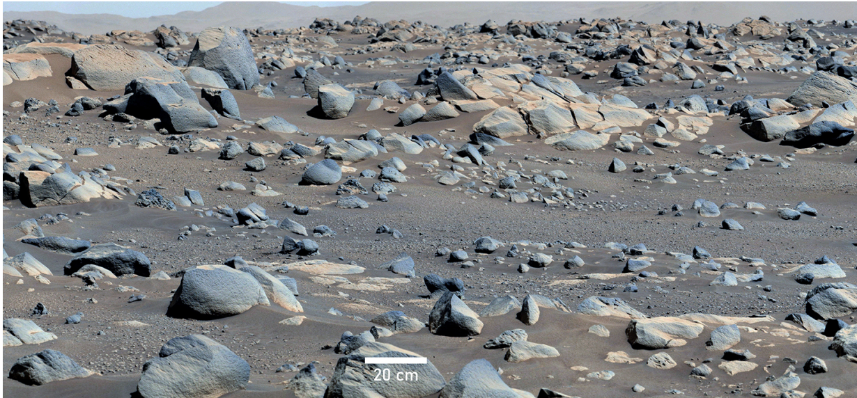
Figure 1. Enhanced-color mosaic of images taken by the Mastcam-Z Left camera of the rover workspace on sol 78 [6].

Orbital data show that the landing site exhibits diverse mineralogical assemblages in various geological contexts, attesting in particular of an ancient aqueous activity during the Noachian and Hesperian eras ( > 3 Ga), and including mafic minerals, carbonates, phyllosilicates and opaline silica [7, 8, 9].