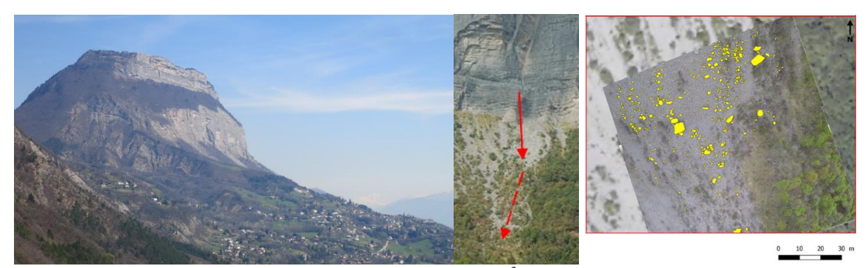
Fig. 1 The Mont Saint-Eynard limestone cliff (left); the 1500 m<sup>3</sup> rockfall (middle); orthophoto of some blocks of the 1500 m<sup>3</sup> rockfall.(right).

A methodology for impact frequency assessment is applied to the Mont Saint-Eynard cliffs, which overhang the Grenoble urban area (Fig. 1). The lower cliff is 240m high, separated from the 120 m high upper cliff by a ledge covered with forest. The upper cliff consists of massive limestone (bed thickness >1 m) while the lower cliff consists of fractured thin bedded (10–50 cm) limestone. The bedding planes dip inside the cliff. This anaclinal configuration, completed by subvertical fractures, produces overhanging compartments falling mainly by toppling.