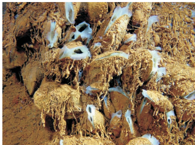
Bathymodiolus azoricus mussels at the Rainbow hydrothermal field, Mid-Atlantic ridge.

Scientific drilling into the ocean floor is fundamental to the study of deep sea floor processes, because it provides the only access to deep and direct sampling and in situ monitoring of the ocean subsurface. Drilling projects, however, should be prepared with a multi-disciplinary and multi-tool approach. The European Consortium for Ocean Research Drilling (ECORD) therefore approached other research programs in Europe involved in paleoclimate studies (IMAGES), ocean margin research (EUROMARGINS, HERMES) and seafloor observation (ESONET) to develop a joint European program on deep-sea science. ECORD is supported by the European Commission through an ERANet, the ECORDNet, of which one specific goal is to establish and strengthen co-operation with other programs and research communities.