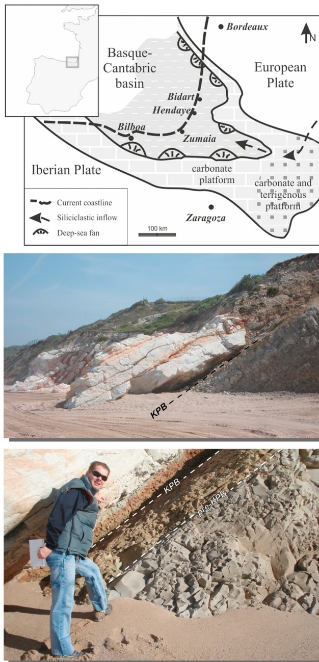
Figure 1. Paleoenvironmental context of the Bidart section [modified from Alegret et al. , 2004] and field photographs.

[Vonhof and Smit, 1997, and references therein]. Continuous sampling involved collecting oriented hand blocks in the field and subsequently cutting them in the laboratory into faceplates 1 cm in thickness.