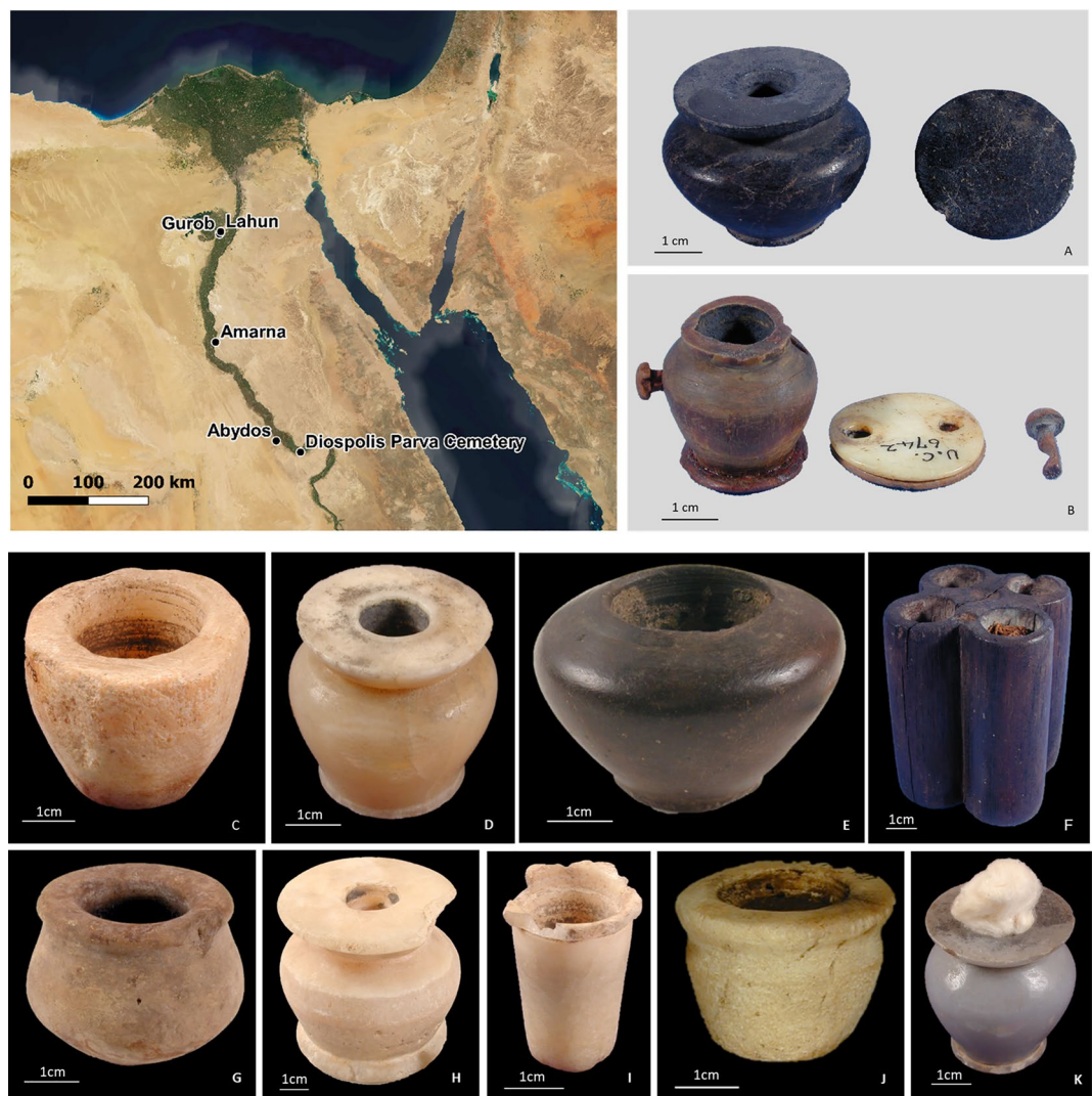
Figure 1. Map and pictures of the 11 kohl containers from the Petrie Museum. Objects UC7321 (A) and UC6742 (B) are from Lahun; objects UC43078 (C), UC42810 (D), UC43107 (G), UC43148 (H) and UC43159 (I) are from Abydos; object UC46343 (E) is from Amarna; object UC7890 (F) is from Gurob; object UC31613 (J) is from Diospolis Parva Cemetery; and object UC64751 (K) is of unknown provenance. Full description of each object is provided in the Supplementary Table S15. The map was created using QGIS (QGIS.org, 2022. QGIS Geographic Information System. QGIS Association).

of fatty acids were identified via gas chromatography/mass spectrometry (GC/MS) in four specimens of kohl. The use of organic materials in kohls thus remains understudied and debated.