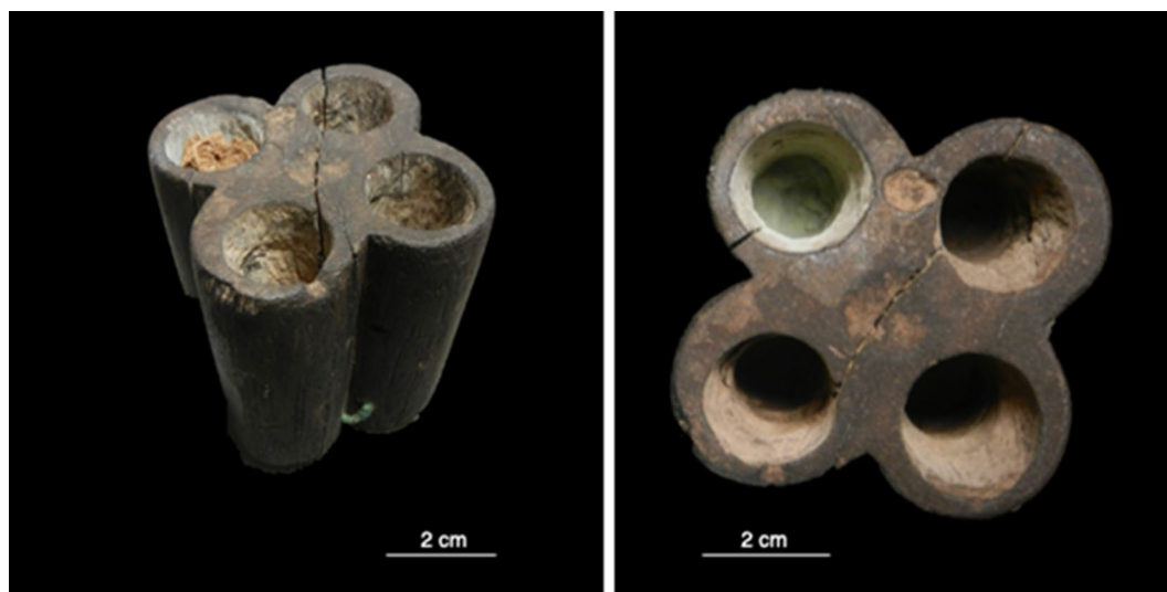
Figure 3. Photographs of the wooden kohl container UC7890 showing the 4 cavities for kohl powder, two of which still contained material that was analysed in this study.

Harris mention that oils and fats used in cosmetics were frequently scented, except when employed by the poorer classes 17 . Sample UC7890a contains the highest and most diverse suite of aromatic compounds. This sample, however, comes from a wood container. It is therefore possible that aromatics from the wood container have diffused into the organic binding medium over time. More research into the type of wood used for this kohl container would be required to confirm this hypothesis.