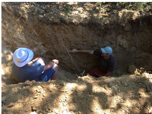
Fig. 2 Detail picture of a trench wall excavated across the causative fault. This is from the first trench out of a dozen that was dug during the 2020 spring; notice the fracture in the colluvium related to a pre-historical activity, with the two authors for scale.