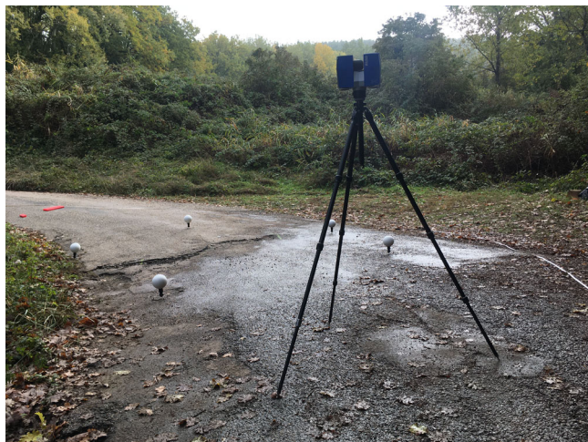
Fig. 1 This tiny scarp on the La Rouvière tar road was the first evidence of Le Teil earthquake-related ground rupture uncovered by the field team (2 days after the event). The equipment is a laser scanner to image accurately the offset.