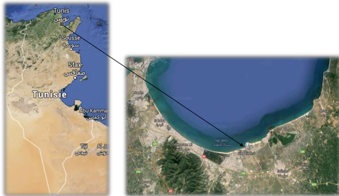
Fig. 1 sampling site. Water and sediment samples from the Sidi-Jehmi beach (north latitude: 36.72072349483175 and East Longitude: 10.438728332519531), located in Borj Cedria, Government of Nabeul, northern Tunisia