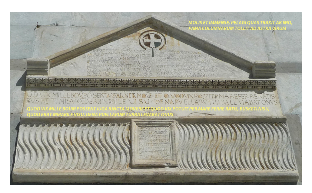
Figure 3: inscriptions in the façade of Pisa cathedral

By analogy with the case of large shafts in Pisa, the 108-cm-diameter Ainay shafts, which are by far the largest found in France, may possibly be interpreted as newly quarried shafts or unused leftovers from the antique quarry in Corsica, rather than spolia from a Roman temple as discussed in [15]. A particularity of the Ainay shafts is that they seem to be derived from two halved original columns based on their short length (about 4.3 m).