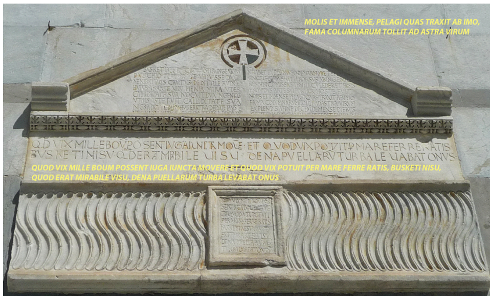
Figure 3: inscriptions in the façade of Pisa cathedral

By analogy with the case of large shafts in Pisa, the 108-cm-diameter Ainay shafts, which are by far the largest found in France, may possibly be interpreted as newly quarried shafts or unused leftovers from the antique quarry in Corsica, rather than spolia from a Roman temple as discussed in [15]. A particularity of the Ainay shafts is that they seem to be derived from two halved original columns based on their short length (about 4.3 m).