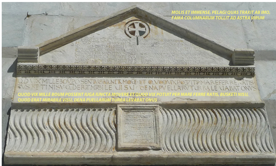
Figure 3: inscriptions in the façade of Pisa cathedral

By analogy with the case of large shafts in Pisa, the 108-cm-diameter Ainay shafts, which are by far the largest found in France, may possibly be interpreted as newly quarried shafts or unused leftovers from the antique quarry in Corsica, rather than spolia from a Roman temple as discussed in [15]. A particularity of the Ainay shafts is that they seem to be derived from two halved original columns based on their short length (about 4.3 m).