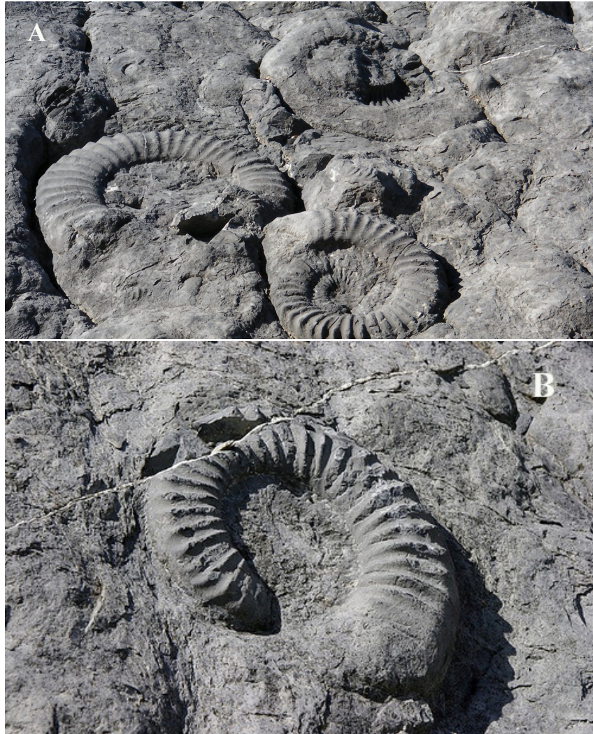
Figure 2. Details of the ammonite Coroniceras multicostatum .

The Ammonite Slab of Digne-les-Bains is an exposed layer of rock, over a surface of around 320 m 2 , where more than 1550 whole or fragmentary ammonites and nautili can be seen. The ammonites indicate a Sinemurian (Lower Jurassic) age (Dommergues & Guiomar 2011). The ammonites, often large (up to 70 cm in diameter), are mainly a single species, Coroniceras multicostatum (Fig. 2a, b; Corna et al. 1990; Dommergues & Guiomar 2011). A modest but varied benthic fauna has also been found, mainly bivalves and echinoderms ( Pentacrinites ). The deposit is much larger than the current outcrop; surface surveys and drilling have shown that it occupies a much greater area, possibly several thousand square meters.