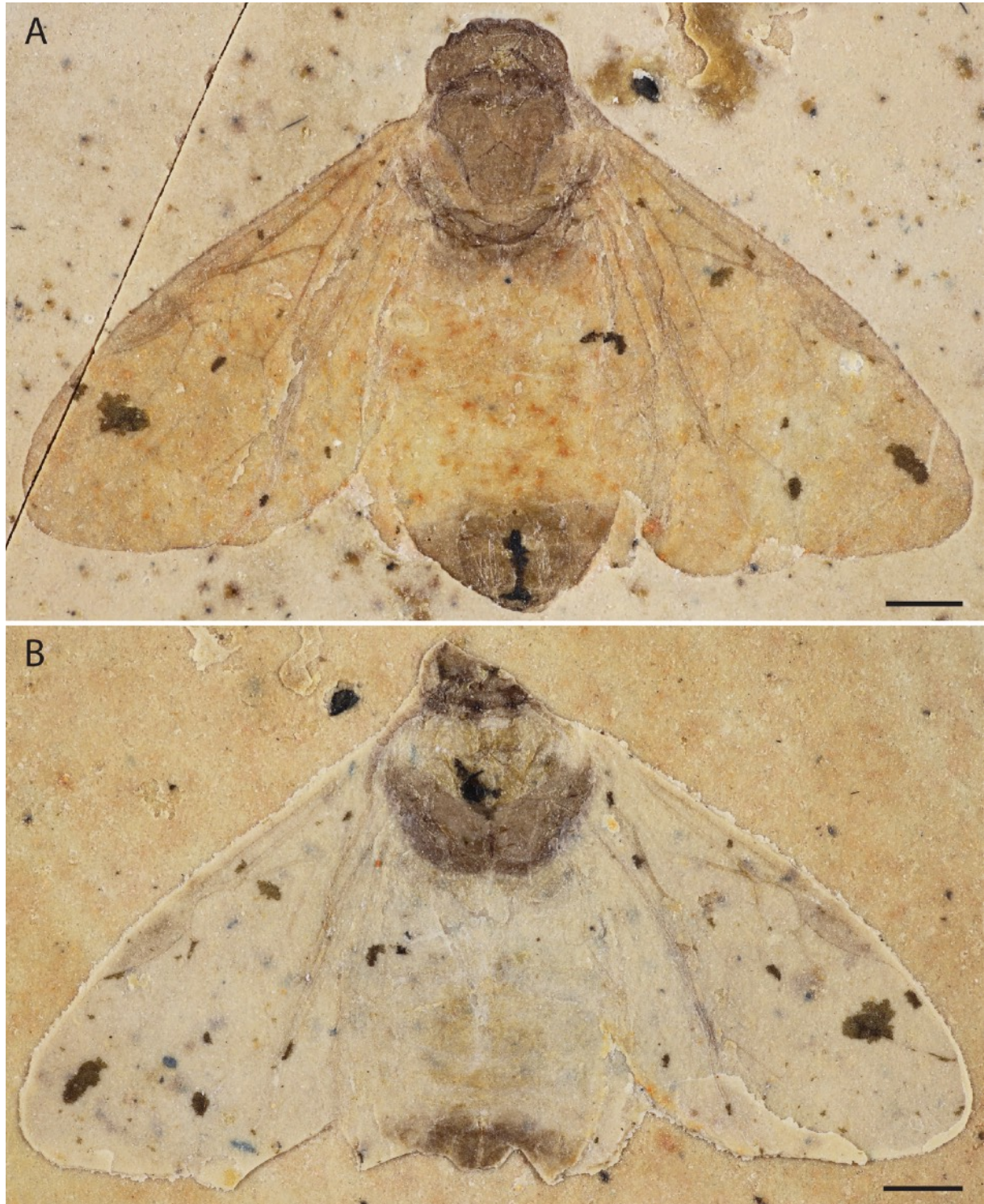
FIGURE 1. Oligomonoctenus neytirii gen. et sp. nov. , holotype MNHN.F.A71362. Habitus.

A, Imprint; B, Counterimprint. Scale bars = 1 mm.