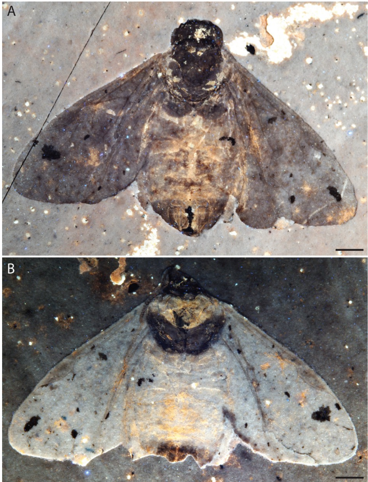
FIGURE 2. Oligomonoctenus neytirii gen. et sp. nov. , holotype MNHN.F.A71362. Habitus under ultraviolet light. A, Imprint; B, Counterimprint. Scale bars = 1 mm.