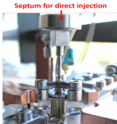
Figure 2: Patented reactor and its oven. This reactor mimics the MOMA Oven volume and heating ramp.