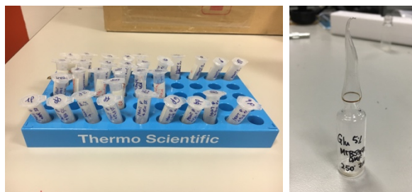
Figure 1: (Left) Montmorillonite samples spiked with organic molecules. Right) a sample sealed with 15 µL of MTBSTFA for MOMA-like derivatization.

The samples were first tested under flash pyrolysis at 650°C, then under a MOMA-like pyrolysis program starting at 45°C and ramped up to 830°C at 200°C/min and held at the final temperature for 2 min. Derivatization was performed on the samples using N,N -methyl-tert-butyl-dimethyl-silylfluoroacetamide (MTBSTFA) and N,N -Dimethylformamide dimethyl acetal (DMF-DMA), two derivatization agents which are implemented in the MOMA experiment. For MTBSTFA derivatization, two techniques were explored for extraction of the organics from the mineral matrix: extraction by solvent (water+isopropanol at 1:1 by volume) and a MOMA-like derivatization where 15 µL of the derivatization reagent was applied directly to the sample. In the case of the extraction protocol, the sample was derivatized at 75°C for 15 min; for the direct derivatization the sample was heated at 140°C (DMF-DMA), 200°C (DMF-DMA) or 250°C (DMF-DMA, MTBSTFA) for 3 min. GCMS injection is by hand-held 1 µL SGE syringe, in contrast to the injection traps used on MOMA [1].