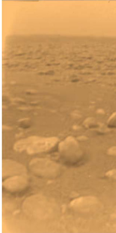
Figure 2. Huygens' 128x256 pixel image from Titan's surface. Dragonfly will acquire larger-scale views of its surroundings, which, combined with higher-resolution images of the sampling sites, will be used to establish the connection between samples analyzed with DraMS and the geological processes at work on sediments at each landing site.

provide evidence for deducing the physical properties of the regolith, much like the investigations by Viking [13]. The slopes of conical piles of drill tailings will allow us to measure the angles of repose while the morphology of the drilled hole provides insight into material cohesion. By monitoring the force applied during drilling, Dragonfly can also investigate regolith bulk hardness. Material properties are especially important for constraining sources and relative ages of Titan's organic sands [14, 15].