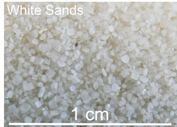
Fig. 2. White Sands in New Mexico, US. gypsum sands.

The gypsum sands of White Sands, NM have an order of magnitude lower hardness (1-2 GPa) than quartz (Fig. 2). These sands have traveled up to 15 km and been formed into dunes. These sands break down into dust and leave the dune system, and must be replenished by new sand, which is created in a playa upwind [6].