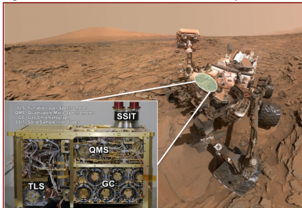
Figure 1. The Sample Analysis at Mars (SAM) instrument suite aboard the Curiosity rover, overlooking at Mount Sharp, Gale Crater, Mars.