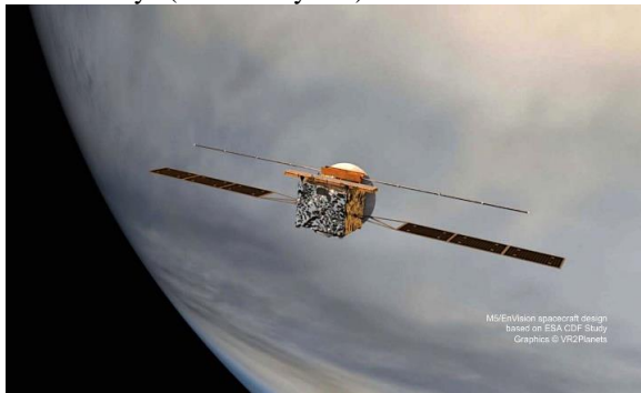
Figure 1: EnVision, following ESA CDF design.

EnVision [1,2] is a Venus orbiter mission that will determine the nature and current state of geological activity on Venus, and its relationship with the atmosphere, to understand how and why Venus and Earth evolved so differently. Envision is a finalist in ESA's M5 Space Science mission selection process, and is being developed in collaboration with NASA, with the sharing of responsibilities currently under assessment. It is currently in Phase A study; final mission selection is expected in June 2021. If selected, EnVision will launch by 2032 on an Ariane 6.2 into a six month cruise to Venus, followed by aerobraking, to achieve a near-circular polar orbit for a nominal science phase lasting at least 4 Venus sidereal days (2.7 Earth years).