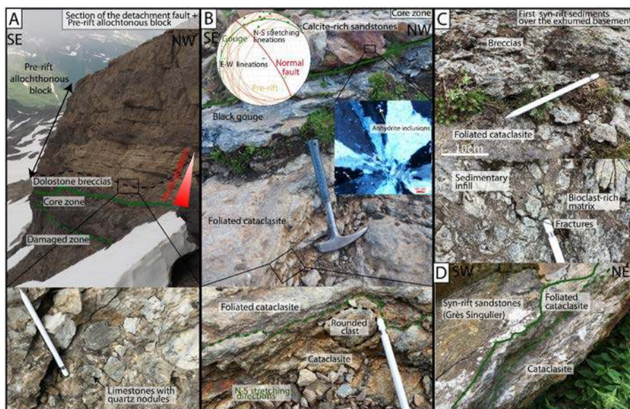
Fig. 1. A- Cross section view of the basement -cover interface (Col des Fours) showing a top tectonized basement composed of cataclasite and gouges overlaid by a pre-rift allochthonous block composed of Triassic dolostones and lenses of basal arkoses. The base of the cover is characterized by the occurrence of tectonic breccias as well as foliated limestones. B- View of the fault-core (Nant des Lotharets, 45° 43' 47.30"N/6° 43' 54.16"E) overlaid by calcite rich sandstones composed of clasts of anhydrite-bearing quartz. The gouges and cataclasites show mostly N–S stretching lineations (dark green points) and some E–W slickenfibers (light green points). The detachment fault and high-angle normal faults are highlighted by the green and red line on the stereogram. The orange planes correspond to the bedding on the pre-rift dolostones C- View of the first sediments overlying the exhumed basement (site: Nant des Lotharets (45° 43' 36.74N/6° 42' 40.39E)) composed of crinoid-rich mud filling fractures in the basement. D- Stratigraphic contact between the Grès Singuliers and the tectonized top basement (site: Plan des Tufts (45° 43' 55.15"N/6° 44' 15.21"E)). (For interpretation of the references to colour in this figure legend, the reader is referred to the Web version of this article.)