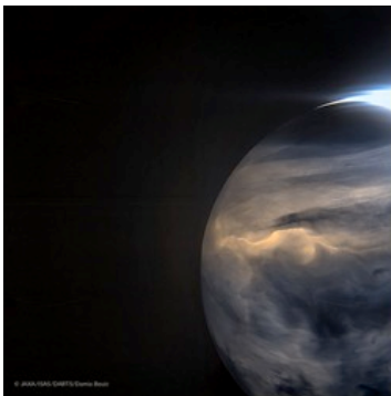
The lower/middle clouds of Venus as imaged by Akatsuki IR2 camera. Dark areas represent thicker clouds, which may represent volcanic plumes of ash or sulphate particulates.

How and why the atmospheres of two Earth-like planets evolved so differently is one of the many compelling reasons to study Venus, directly addressing the question of how our own world became habitable. Understanding its evolution depends on knowing the exchanges between its interior, surface and space.