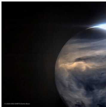
The lower/middle clouds of Venus as imaged by Akatsuki IR2 camera. Dark areas represent thicker clouds, which may represent volcanic plumes of ash or sulphate particulates.

How and why the atmospheres of two Earth-like planets evolved so differently is one of the many compelling reasons to study Venus, directly addressing the question of how our own world became habitable. Understanding its evolution depends on knowing the exchanges between its interior, surface and space.