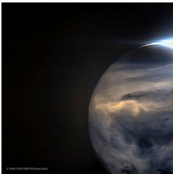
The lower/middle clouds of Venus as imaged by Akatsuki IR2 camera. Dark areas represent thicker clouds, which may represent volcanic plumes of ash or sulphate particulates.

How and why the atmospheres of two Earth-like planets evolved so differently is one of the many compelling reasons to study Venus, directly addressing the question of how our own world became habitable. Understanding its evolution depends on knowing the exchanges between its interior, surface and space.