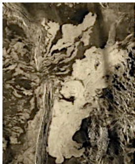
Magellan radar image mosaic of a 550 km wide region of Lada Terra (47°S, 25°E) showing a system of radar-bright and dark lava flows breaching a ridge belt and ponding in a large radar-bright deposit covering 100,000 km 2 . Ammavaru, the source caldera, lies 300 km to the west (JPL/Caltech).

Venus should be geologically active today and its globally young surface implies extensive volcanic resurfacing, but whether this happened in episodic global events or in a continuous process of small-scale resurfacing is uncertain. Constraining the rate of volcanic and tectonic activity can reveal whether Venus occupies one of these end members, or lies somewhere on the spectrum between.