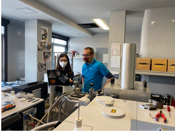
Figure 2. The VEM prototype during measurements at PSL to verify the instrument performance using Venus analogs at Venus surface temperatures

The PSL setup will be used extensively in the calibration campaign for the flight instruments for VERITAS and Envision.