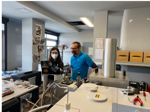
Figure 2. The VEM prototype during measurements at PSL to verify the instrument performance using Venus analogs at Venus surface temperatures

The PSL setup will be used extensively in the calibration campaign for the flight instruments for VERITAS and Envision.