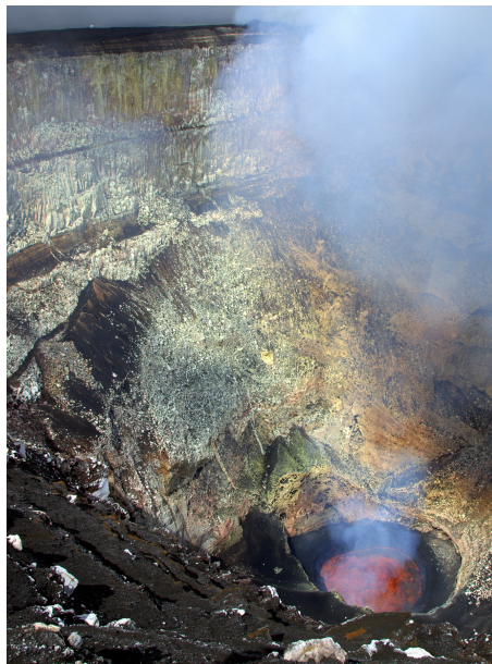
Photo: The persistent lava lake lying at the bottom of the crater of Ambrym volcano in Vanuatu, and the plume of gases and aerosol discharged by the convecting magma column sustaining the lava lake (credit: C. Oppenheimer).

Manuscript received 19 November 2024, accepted 12 December 2024.